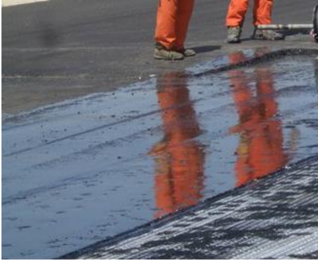
Figure 7 : Mirror effect of bond coat immediately after application