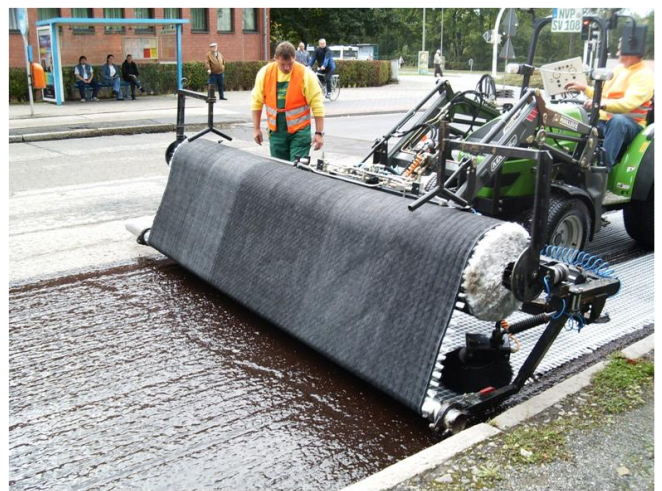
Figure 4 : Mechanical installation with purpose-built machine