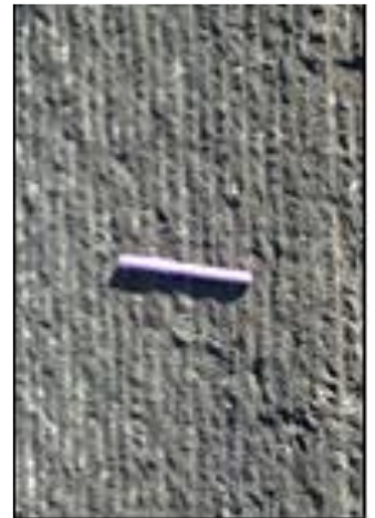
Figure 1: Finely milled substrate