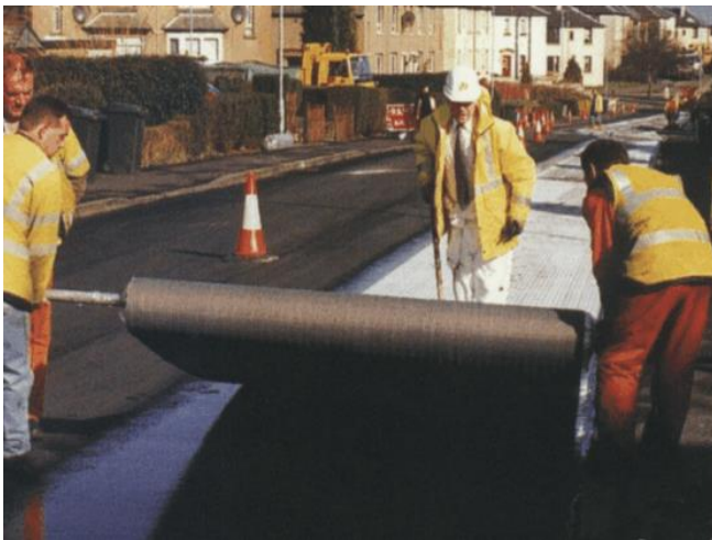
Figure 3: Manual installation – maintaining tension and brushing to prevent wrinkles