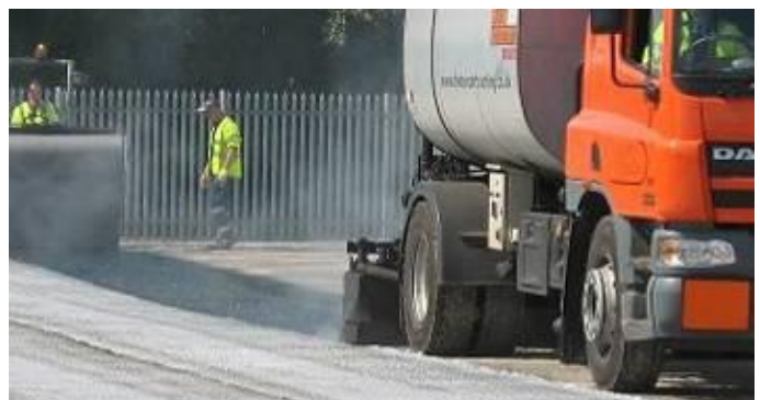
Figure 5 : Spraying with an overlap