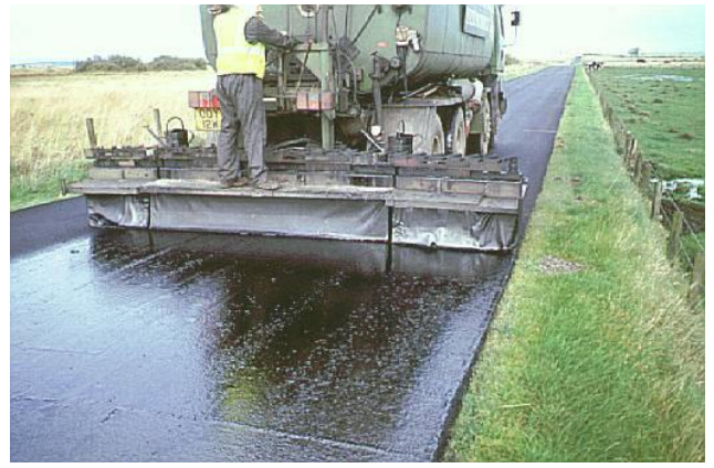
Figure 2: Bond coat application

The quantity should be measured controlled and recorded. It may vary and needs to be adjusted according to surface conditions (for example porous surfaces require more bitumen). As a visual help on site to indicate that the spray rate may be correct, the bitumen film should provide a reflective mirror effect. Footsteps and vehicle tyres should leave a black print. Note that visual indicators do not replace the need for correctly calibrated spraying equipment and experienced staff on site ensuring the appropriate spray rate.